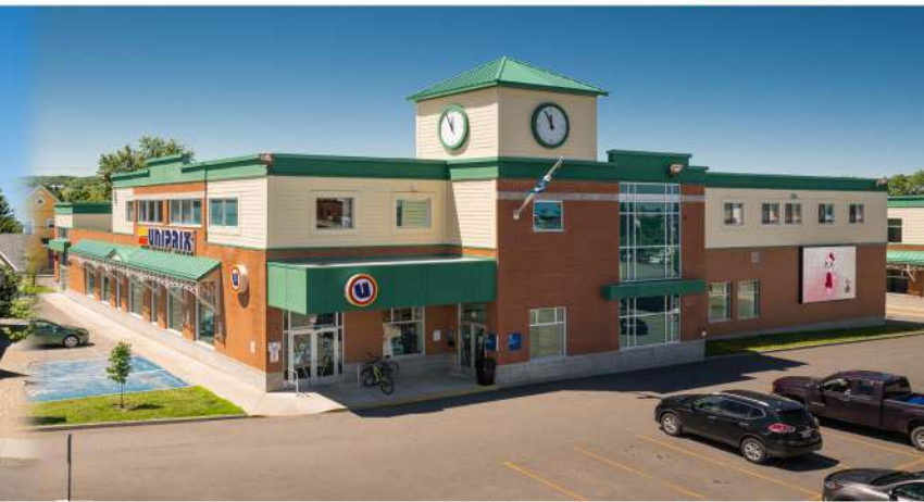
40, rue Doucet, MONT-JOLI