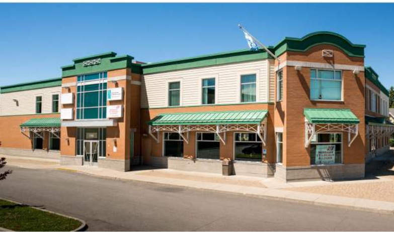
1490, rue Lindsay, MONT-JOLI